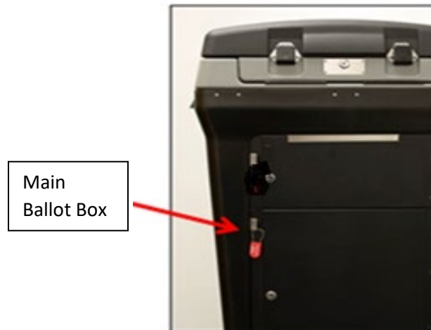
Figure 1 - Seal on the Main Ballot Box on the Scanning Unit