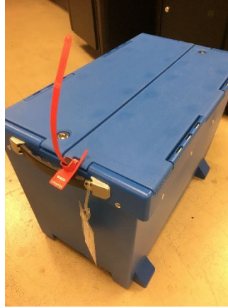
Figure 4 - Security Seal on One Side of the Ballot Transfer Bin Lid