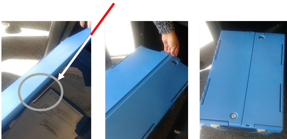
Figure 3 - "Tongue-in-groove" Fit on the Ballot Transfer Bin