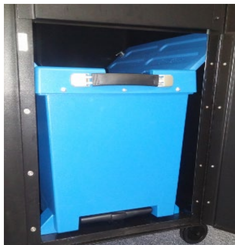
Figure 5 - Open Lids on the Ballot Transfer Bin