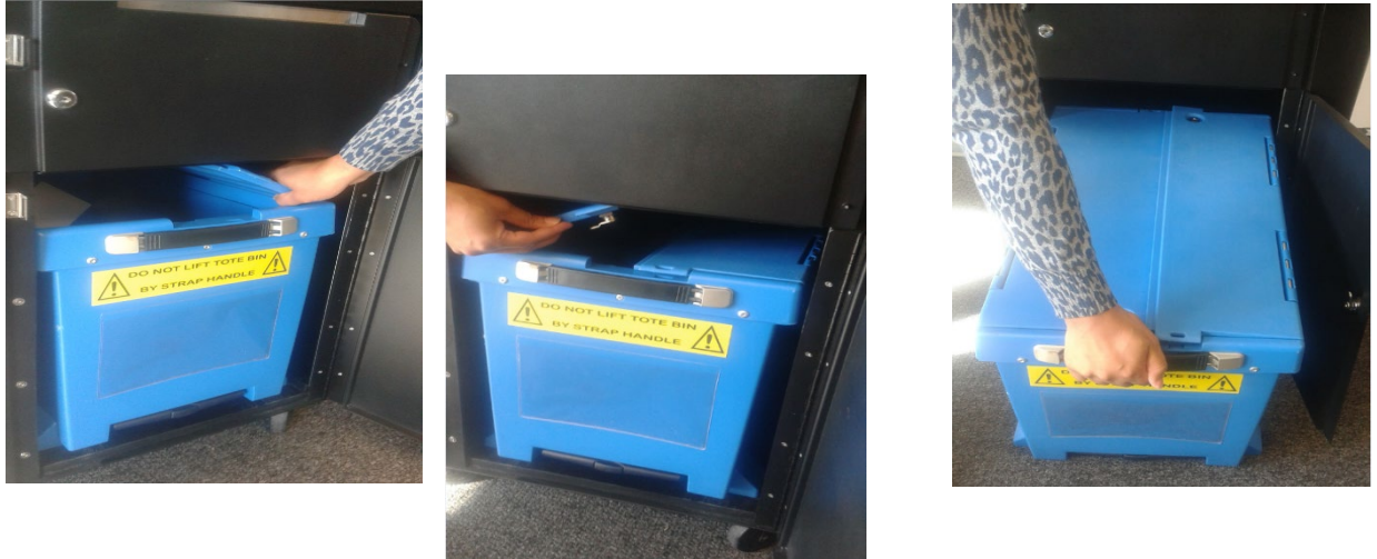
Figure 2 - Removing the Ballot Transfer Bin from the Scanning Unit